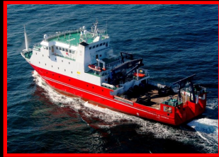
R/V Sarmiento de Gamboa