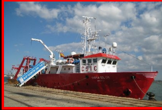
R/V García del Cid