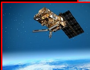
ADVANCED REMOTE SENSING