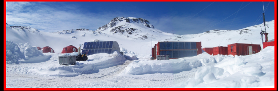
Spanish Polar Station Juan Carlos I